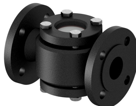
DN 32 to DN 50