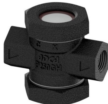
1/2" to 1"

INSTALLATION: Horizontal or vertical installation. See IMI – Installation and maintenance instructions.