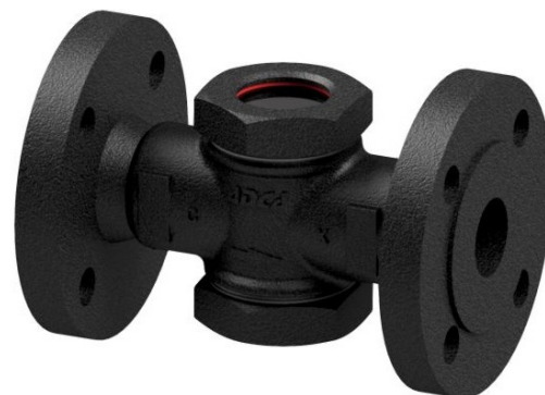
DN 15 to DN 25