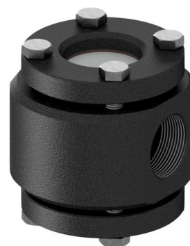
1 1/4" to 2"